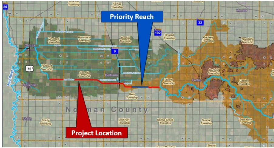
Figure 1. Project location.

Zach Herrmann, the SHRWD District Engineer, presented information about the project location (Figure 1, Figure 2), the purpose and need, and potential funding options.